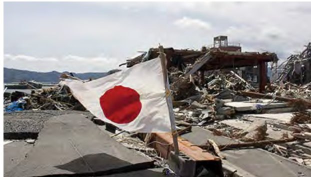
Figure 1 Devastation of March 11, 2011 earthquake in Honshu, Japan.

In 2010, a major earthquake struck Haiti, destroying or damaging over 285,000 homes [19] . One year later, another, stronger earthquake devastated Honshu, Japan, destroying or damaging over 332,000 buildings, [20] like those shown in Figure 1 . Even though both caused substantial damage, the earthquake in 2011 was 100 times stronger than the earthquake in Haiti. How do we know? The magnitudes of earthquakes are measured on a scale known as the Richter Scale. The Haitian earthquake registered a 7.0 on the Richter Scale [21] whereas the Japanese earthquake registered a 9.0. [22]